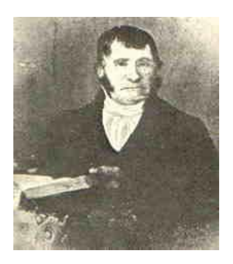
Charl (Sarel) Arnoldus Cilliers (7 September 1801 – 4 October 1871)

Blood River has been described as the largest battle to have occurred between white and black in South Africa. It however was not the end of the battle against Dingane. On 27 December 1838 the commando of the Trekkers were lured into an ambush at the White Umfolozi River and a number of commandos were killed, but the final resistance of the Zulus was broken and this meant the end of Dingane's rule. On 15 March 1840 Dingane was killed by warriors from the Nyawo tribe, possibly assisted by Swazi warriors. After Blood River the immigration by whites into Natal increased. Thousands of blacks who hid in isolated cliffs and caves from the tyrannous and despotic reign of Dingane, could also return to their original places of residence. Nevertheless, members of the Zulu tribes declared a century later: "For us Zulus, the sun has long since set at Ncome (Blood River)...". Never again would they be the sovereign rulers of Natal.