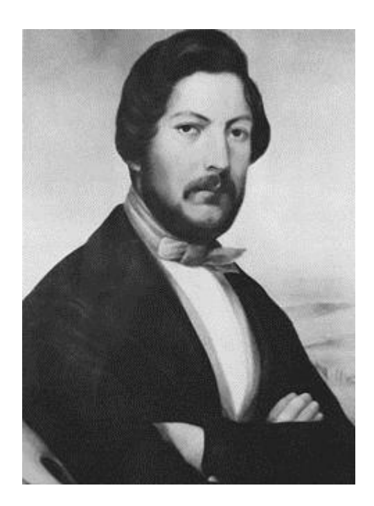
Andries Wilhelmus Jacobus Pretorius (27 November 1798 – 23 July 1853)